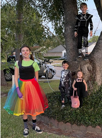
The Pubchara Kids

Kiddos (and kiddos at heart) came together this fall to celebrate Halloween. It's always great fun to see the costumes - some cute, some creative, some confusing! Not to mention, a little friendly neighbor-to-neighbor decorating war can raise the Halloween bar! Here are some photographs from this year's events!