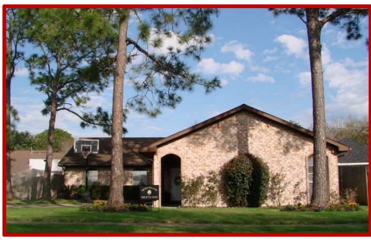
Your neighbors thank you for all your hard work and dedication: your yard is a joy to behold!

Bright green, sparkling grass, colorful pansies circling mature pine trees - this home says Spring is Here! The Deloya - Gharatappehs have lived here for 17 years and this is their first time to be YOTM; our records indicate this is this home's first time too. Considering our recent unfriendly weather, having a lawn, shrubs and flower beds in pristine condition indicates wise selections of hearty plants and proper maintenance.