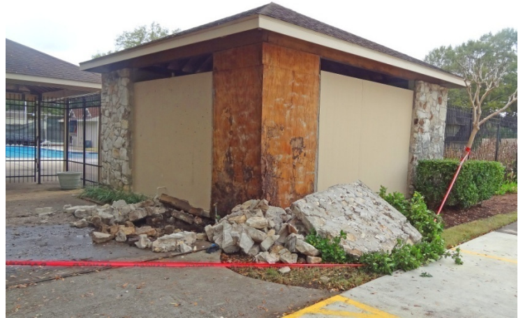
Above photo shows damage to the stone in December 2018.

In early December, plans were solidified, and the bathroom renovation project was a go, when all of a sudden an errant pick up truck careened up the pool sidewalk, bounced off the stone border, crashed into the waterfall boulders, smashed over some bushes, and nailed the stone corner of the bathhouse – hard! Hard enough the stone was knocked off and the truck was stuck. So, not only were we gutting the inside, but thanks to this event, we had to do some unplanned repair outside. The insurance adjuster’s estimate was $7,000 damage, our deductible was $1,000. Luckily, no one was hurt.