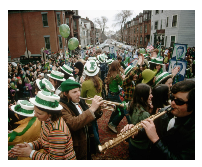
History Channel, History of St. Patrick's Day (Feb. 26, 2020)

In 1848, several New York Irish Aid societies decided to unite their parades to form one official New York City St. Patrick's Day Parade. Today, that parade is the world 's oldest civilian parade and the largest in the United States, with over 150,000 participants. Each year, nearly 3 million people line the 1.5-mile parade route to watch the procession, which takes more than five hours.