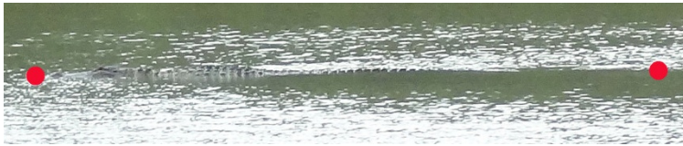
It's an American Alligator at least 6' – 8' long and only slightly shy of humans; below its head is to the left.