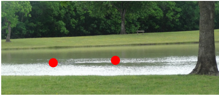
Below is a closer look at what's between the dots.

Bench in distance for scale, see dots and wake