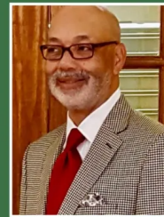
DIRECTOR OF ECONOMIC DEVELOPMENT