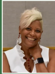
2ND VICE PRESIDENT