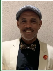
1ST VICE PRESIDENT