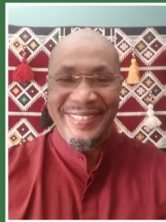
COUNSELING PROGRAM DIRECTOR