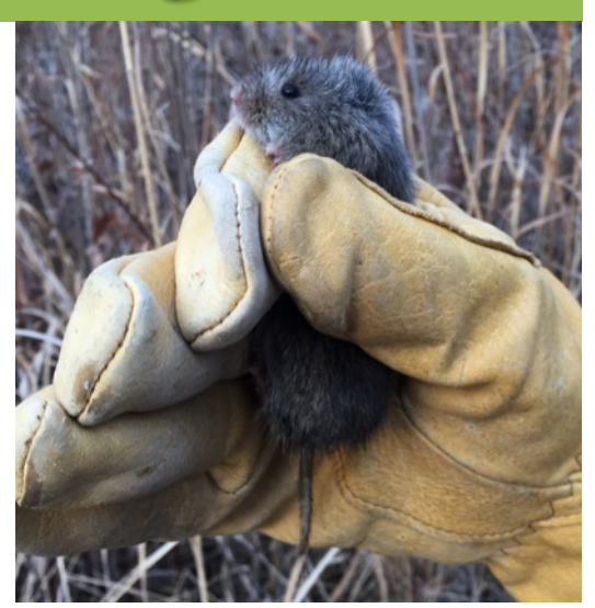
Captured Meadow Vole

We think of small mammals hibernating in winter but many were active all winter. Laudato Si' Project is beginning some small mammal surveys using live traps in order to gain understanding of what lives in certain areas and how many. The goal is also to create programs open to the public so they can see many of these amazing critters up close. This also gives an opportunity to students interested in conservation work to see the ways in which research scientists monitor and study these animals. Our target species include: meadow vole, short-tailed shrew, meadow jumping mouse, woodland jumping mouse, deer mouse, 13-lined ground squirrel and flying squirrel.