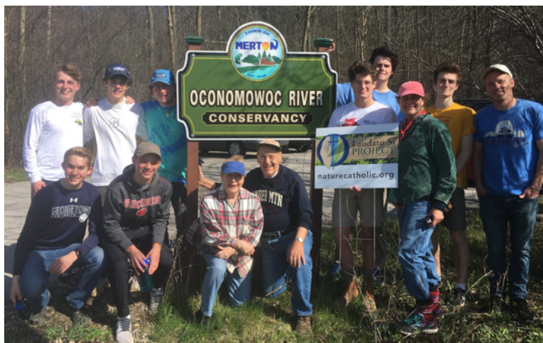
2018 LSP trail building volunteers

In 2018 ( pictured below ), Laudato Si' Project volunteers began creating the new trail up to the lookout where the observation deck now stands. It is fulfilling to be able to complete that trail and allow for a connection loop to the Monches segment of the Ice Age Trail.