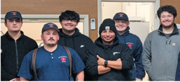
Chelan County Fire District #6 New Volunteer Firefighters.