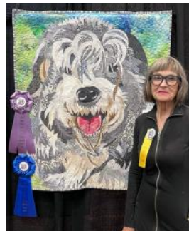
The Sweetest Dog