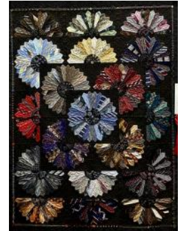
Life's a Journey