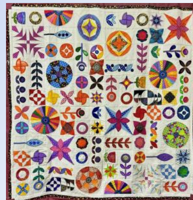
Curves and Polka Dots Ahead

Made in 2023 for me. This is a block of the month pattern by Jen Kingwell called Caution Curves Ahead. It involved turned edge applique blocks each month and curved machine piercing blocks each month. I took the additional step to hand embroider and outline stitch around the applique pieces. I used only fabrics from my stash of polka dots or circle themed fabrics. I still did not make a dent in my stash!