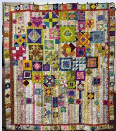
Someone's Wife Pattern by Jen Kingwell. Originally called Gypsy's Wife. Was changed to Wanderer's Wife but sometimes I forgot and called it Traveler's Wife!!