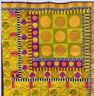
Not my thing #2 Made for me. Another online class. After two months and six small quilts I decided modern quilting is not my thing. But I will bring the other quilts when they are quilted.