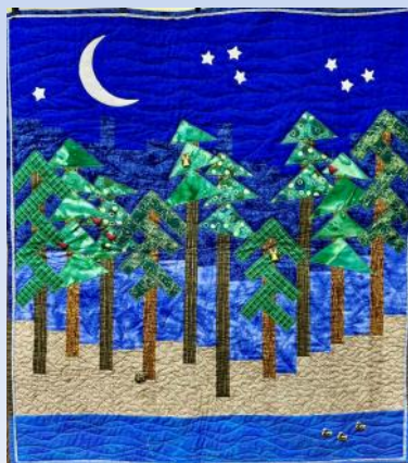
10 Tall Pine Trees

Made this year for I don't know who yet. Bluebonnets were from a workshop I took in the spring.