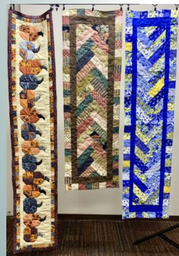
Table runners made for friends and myself (the pumpkins)