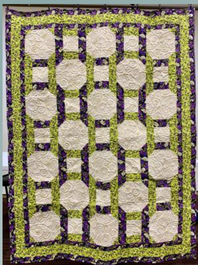
Lattice in Purple