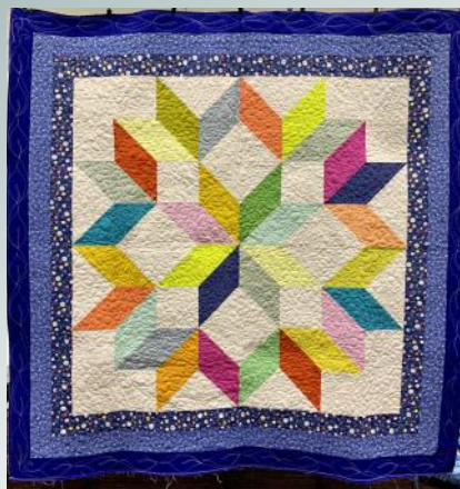
Charity quilt top