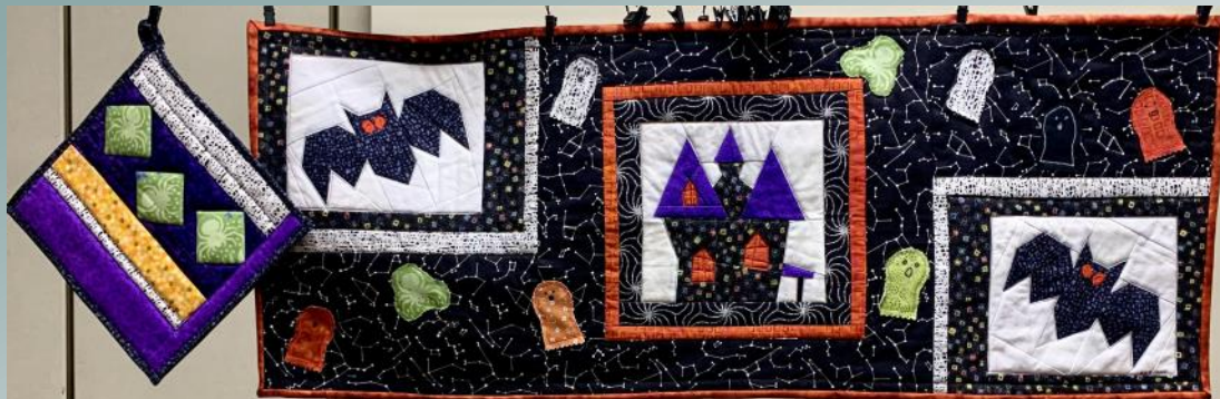
Halloween Potholder Just finished. Made for son and family. Leftover block from table runner.