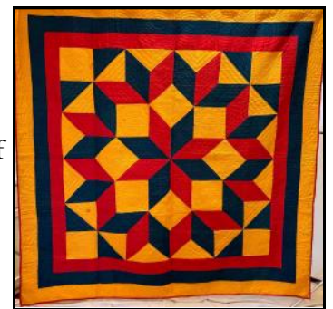
Mennonite Carpenter's Square (76" x 76") c. 1890, artist unknown