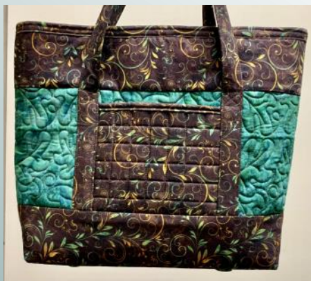
Bon Voyage Bag

Made August 2023 for a birthday gift for a friend. Started in a class at Quilters Emporium and finished about two weeks later. I liked the idea so much I plan to make five more as gifts, and maybe even one for me!