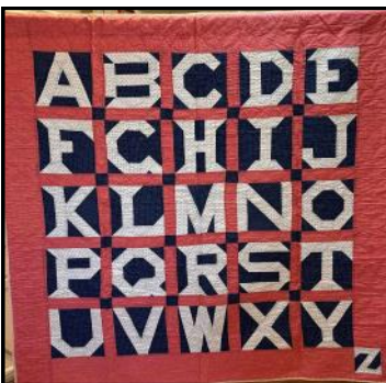
Alphabet Quilt (72" x 76") c. 1870, artist unknown