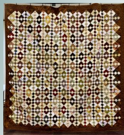
Carolina Brownies Made from August 1st to August 31st, 2023, for my collection. This is the 9th in my series of Carolina chain quilts. This one features browns and rust colors and is perfect for fall season. Approximately 90 inches by 90 inches. I had a great time making the pieced back.