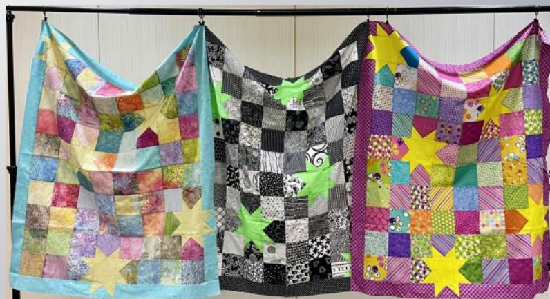
Oh My Stars