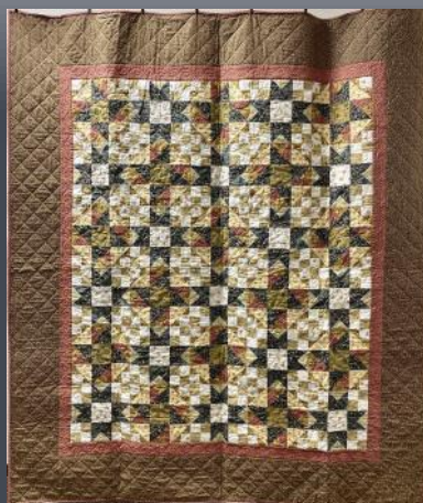
Avalon Scrapy Summer