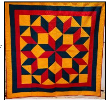
Mennonite Carpenter's Square (76" x 76") c. 1890, artist unknown