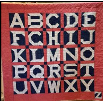
Alphabet Quilt (72" x 76") c. 1870, artist unknown