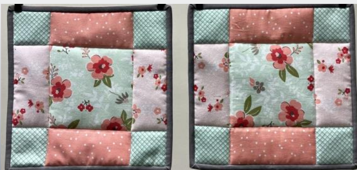
Nine Patch Potholders