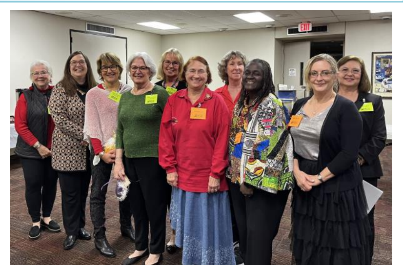
QGGH 2024 Executive Board