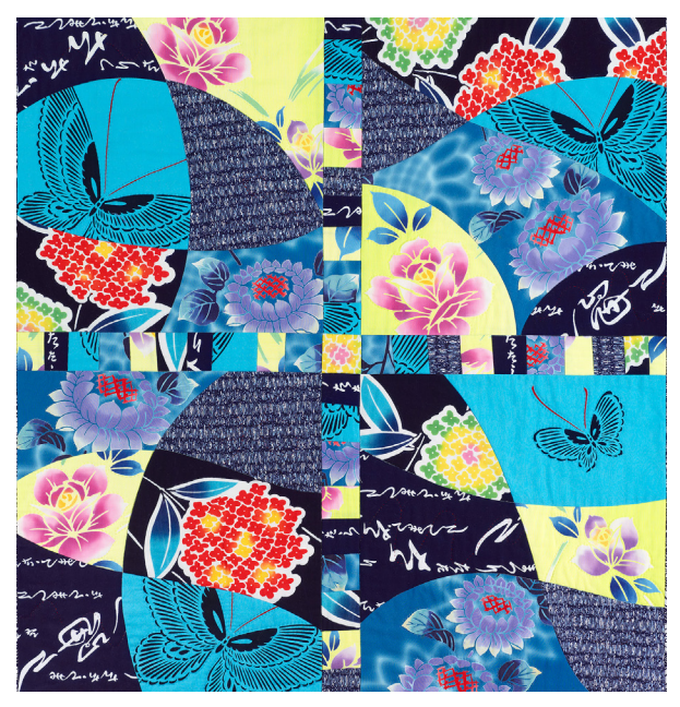
Workshop Sample: Floating World, 36" x 36"

Lead pencil and good eraser Lots of fine pins and a pin cushion Fine black Sharpie Freezer paper, 4 pieces, 18" x 18"