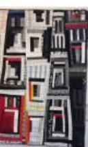
linear abstract art quilts