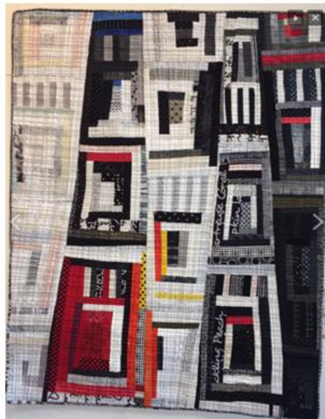
linear abstract art quilts