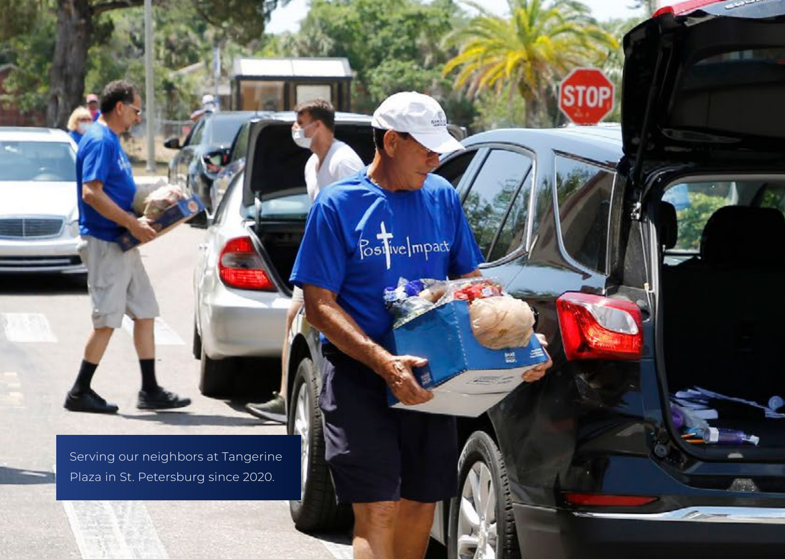
Serving our neighbors at Tangerine Plaza in St. Petersburg since 2020.