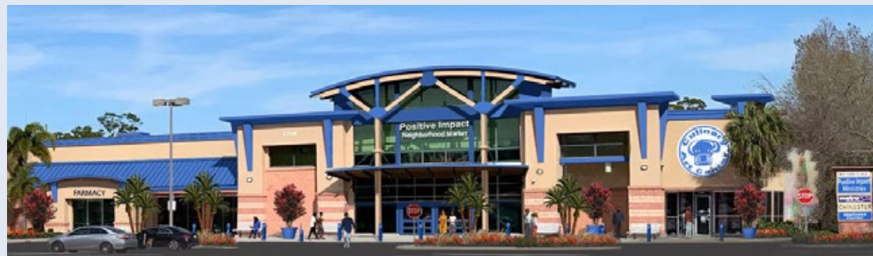
Artist's rendering of a proposed Neighborhood Market at Tangerine Plaza, currently owned by the City of St. Petersburg.

With campaign investments, our vision of owning a state-of-the-art facility will become a reality and an incubator for personal growth and innovation.