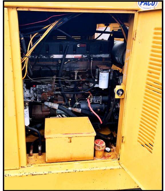
Photo 2 of 3 - Power Unit Cummins Engine