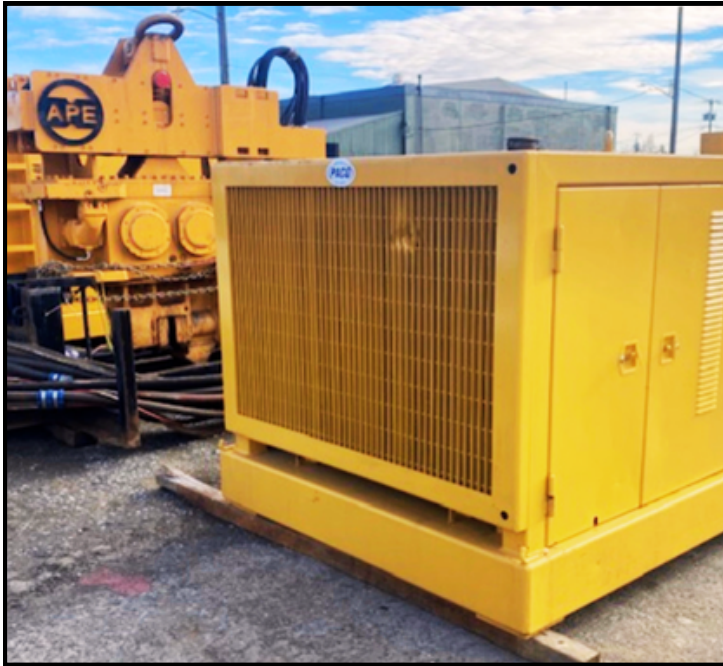
Photo 1 of 3 - 150 Vibro & Power Unit