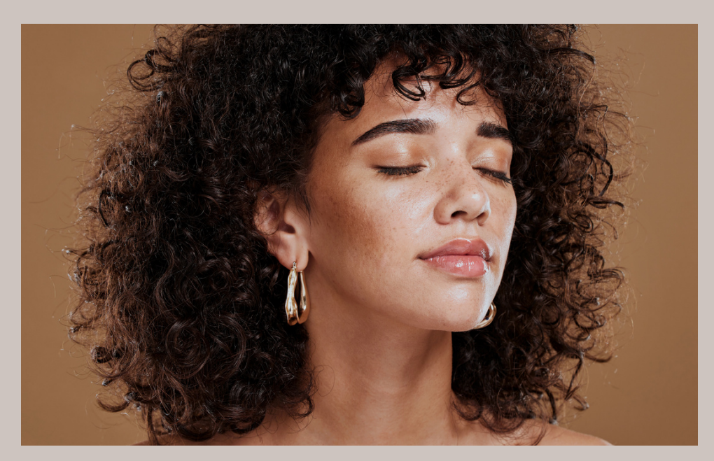
SERVICES AND PRODUCTS MAY CHANGE PER SEASON