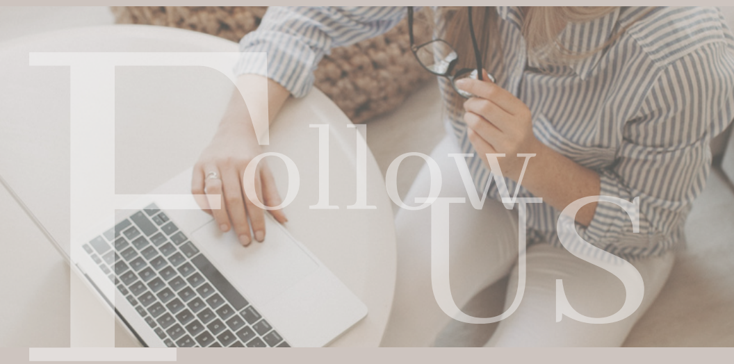
Follow us on social media and share with Everyone!