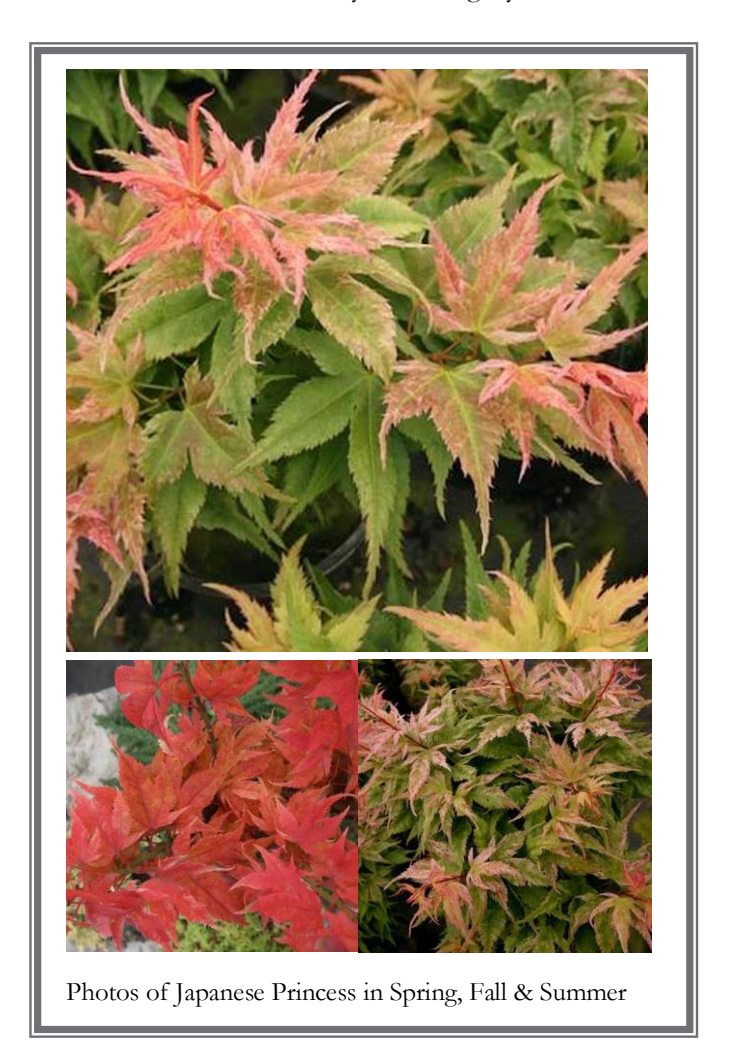
Embrace the beauty of you.

in the Hair Salon and Day Spa categories, so we are grateful for the vote of confidence from our community. We endeavor always to be worthy of the faith entrusted in us to serve the community with integrity and with love.