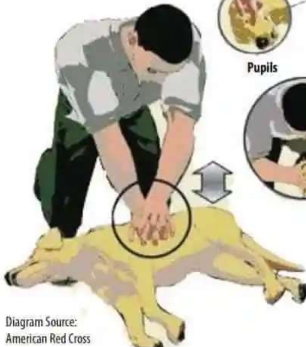
Diagram Source: American Red Cross