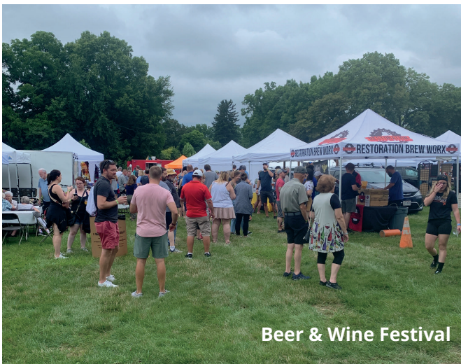
Beer & Wine Festival