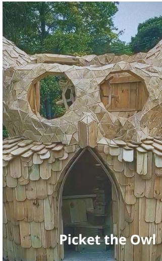
Picket the Owl