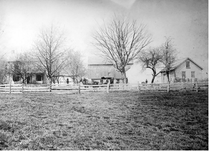
View of Applebachsville House of Amadeus Atherholt This photo was taken before houses were built in front of the property.