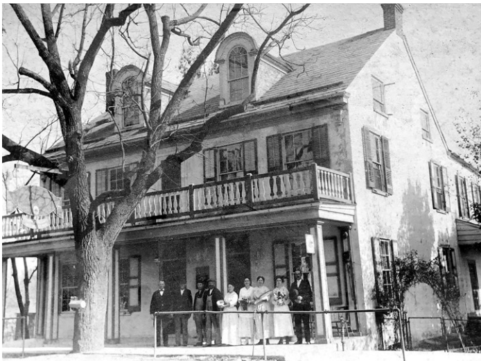
Photo of the hotel in Applebachsville in earlier times.