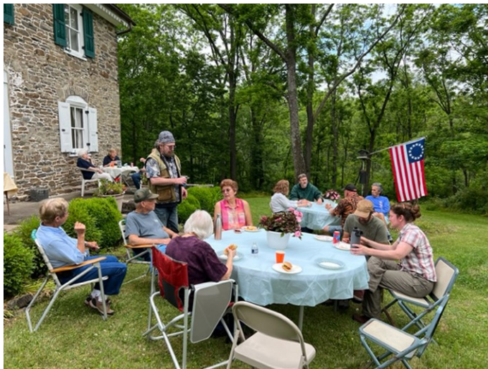
June Potluck Picnic