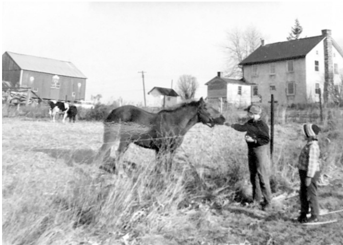
Murray Children and Farm

Between the house and the milk house was a concrete pad that covered a hand-dug artesian well. In the milk house was a deep well with a large electric motor that powered a large belt drive system for the pump. This supplied water to the barn. Next to the milk house were rhubarb plants. Between the milk house and the barn was a driveway that went back to the garage. To the right of the garage were the outhouse and the corncrib. To the left of the garage was a rundown old pigpen. Behind the pigpens were about 7 or 8 chicken coops. Since my dad had no intentions of raising chickens, he tore down the chicken coops.