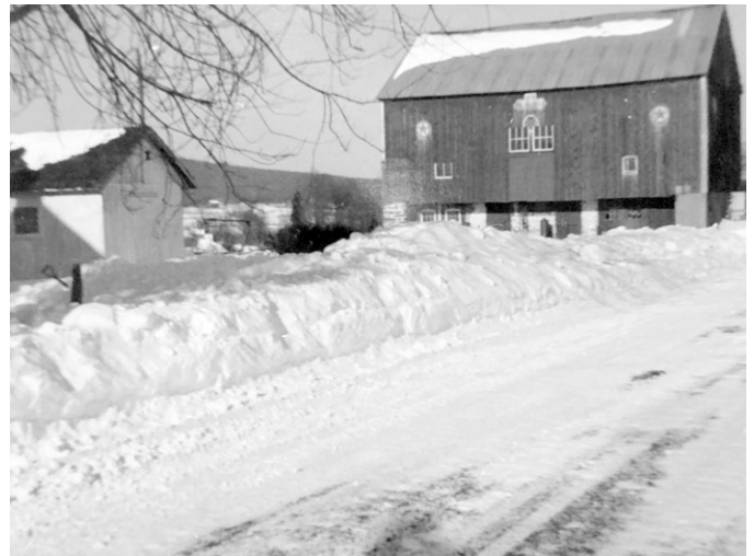
Murray farm on Ridge Road

There were no bathrooms in the house when it was first bought. We kept a large covered pot at the top of the basement steps and dad would empty it every night when he came home from work. In order to get water to the kitchen sink, we had to go into the basement and plug in the piston pump. In the laundry room was a hand pump and a large