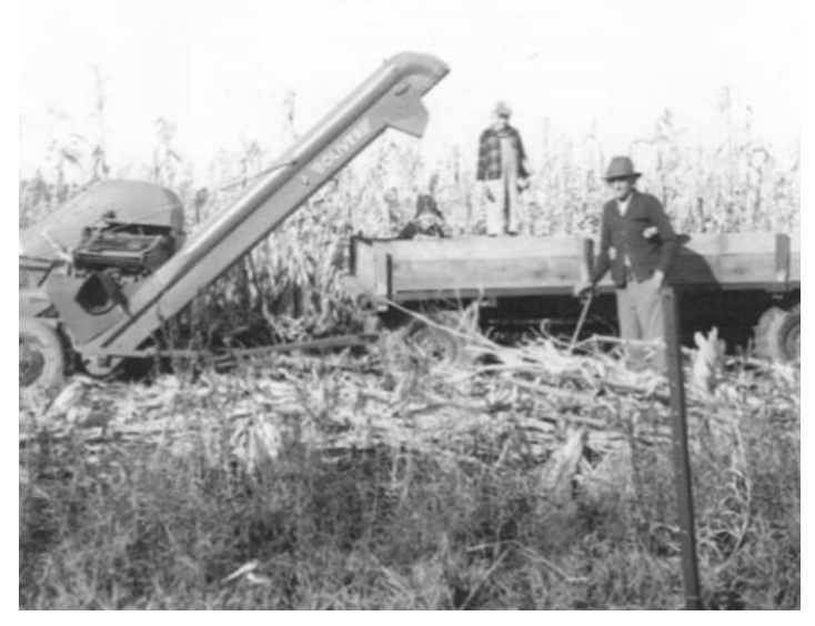
Grandpop Smell with Dave (standing) and Bill Guttman, harvesting corn, Fall 1951.

The Palmer farm was comprised of 120 acres planted mostly in corn to help feed up to 60 Guernsey cows, and one very ornery bull. When harvest time came, everyone pitched in according to their age and abilities.