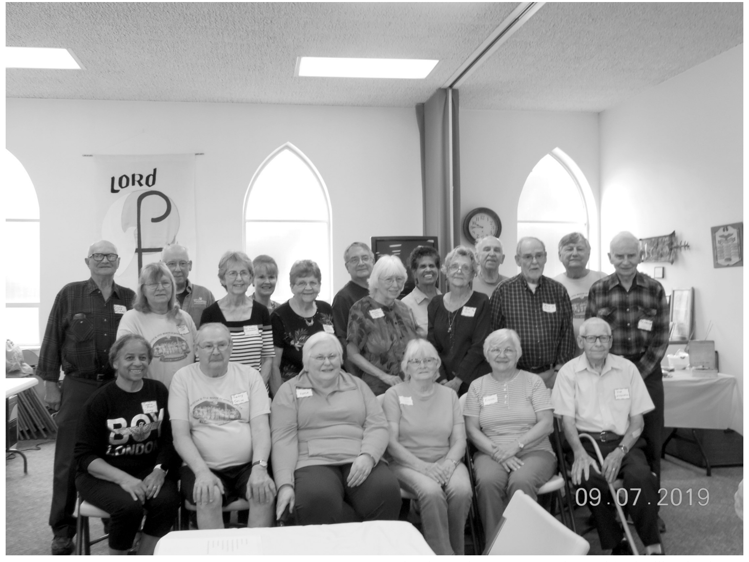
"One-Room-Schoolers" Still Making History