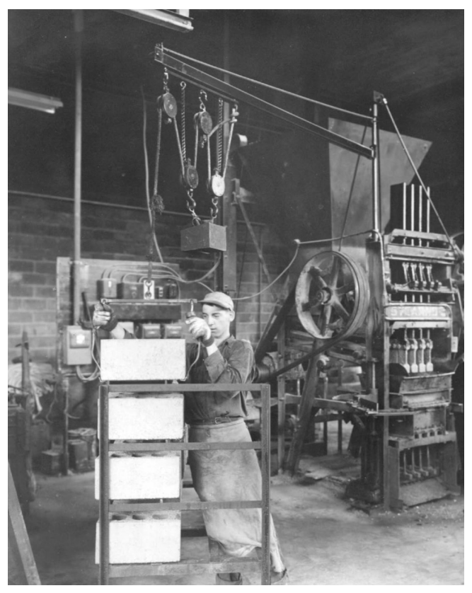
An employee of the Palmer Block Works, taking blocks from the new machines in which they were made and placing them on a rack. When the rack was full it was rolled in to the kiln, circa 1957.

The company now had eight full-time employees, and an inventory of over 1 million blocks, which they shipped from New York to Delaware to Ohio.