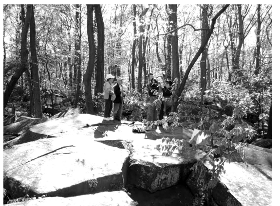
The top of Haycock Mountain

On April 29, 2012, a party of 9 HHS Members met on East Sawmill Road, at the Rte 563 underpass ( by the site of the former Shellenberger's Mill) at 1:00 P.M. to hike to the top of Haycock Mountain. The last time an HHS group went up via this route was four vears ago. The devastation brought about by the freak 2011 Halloween storm was quickly evident at the lower elevations beyond and to the right of the water tower. Fallen trees and the beginnings of briars & undergrowth completely obliterated the original path, making it too difficult to traverse. Thankfully, party member Rich Cope was able to scout out an alternate route to the top for the group. The brisk sunny day was perfect for the hike. Among the things encountered along the way were late springblooming wildflowers-Showy Orchis & Spring Beauties. No Morrell mushrooms were spotted, but some of the HHS members encountered a shy snake who quickly The top of headed away at the sound of the group. the mountain was buzzing with human activity on this day. Nockamixon State Park was also leading a nature hike. A group of Adventure Triathelon Endurance Racers was making its way to the top as part of their adventure. Various "rock jumpers" were also encountered, carrying their mats on their backs. After a rest and refreshment break on Top Rock, the group headed back down by way of the path the other groups had used, arriving back at their cars at 5:30 P.M.