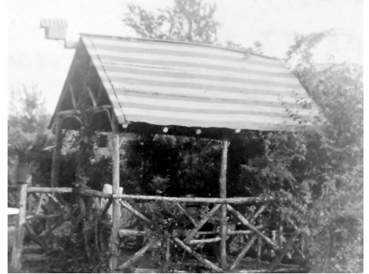
The Schreier Farm in the 1930's