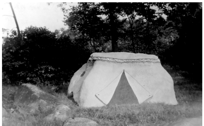
Boulder painted to look like a tent

"The Painted Rock" continues to is also very artistic, fade since this photo was taken showing talent that one of his childhood teachers wanted him to attend art school.