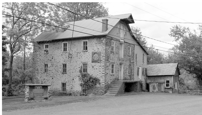
Historic Sheard's / Clymer Mill