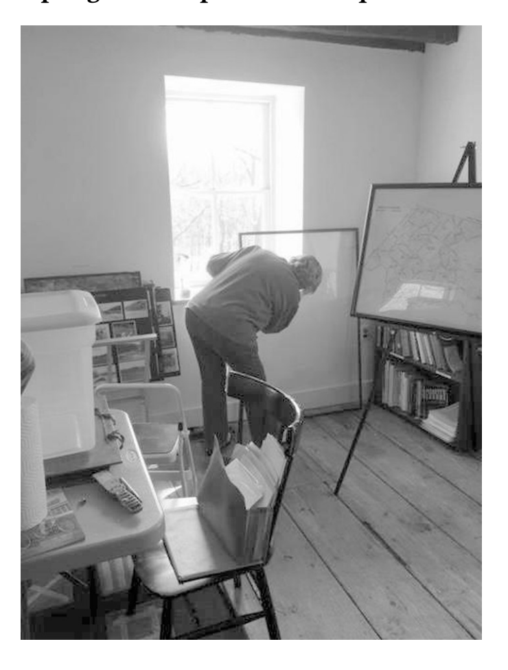
Cleaning the storm windows