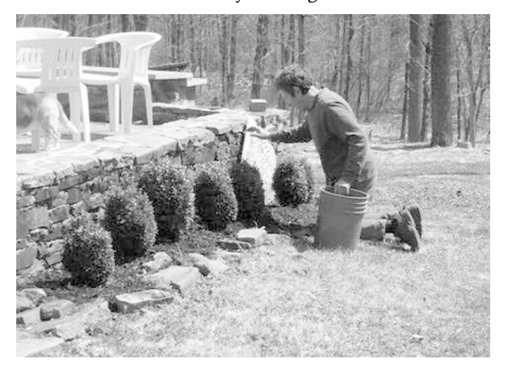
Tending the Box Wood

Preparing the flower pots at the Stokes House, prior to one of our Friday morning visits.