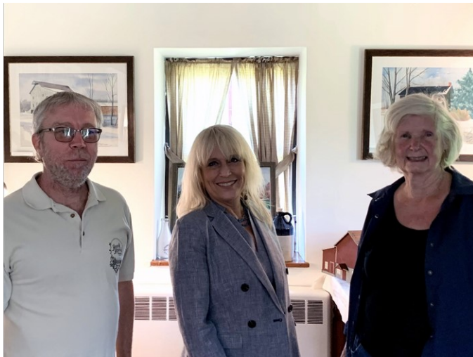
Bucks County Commissioner

In the middle of April 2021, the historical society's board realized that the lease on the John Stokes house was coming up in February 2022. The society first leased the house in 2010, for one year, at the encouragement of their members. We found the house in need of sprucing up but structurally sound. Our first board meeting at the Stokes house was in March of 2010 and the heat had not been turned on. We thought that an electric heater would help with the cold, but unfortunately, we sat there with coats, gloves, and boots, wondering what we had gotten into.