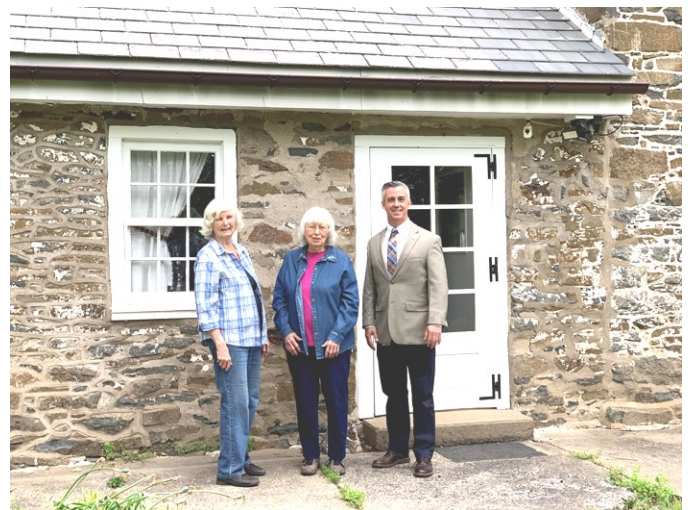
Bucks County Commissioner