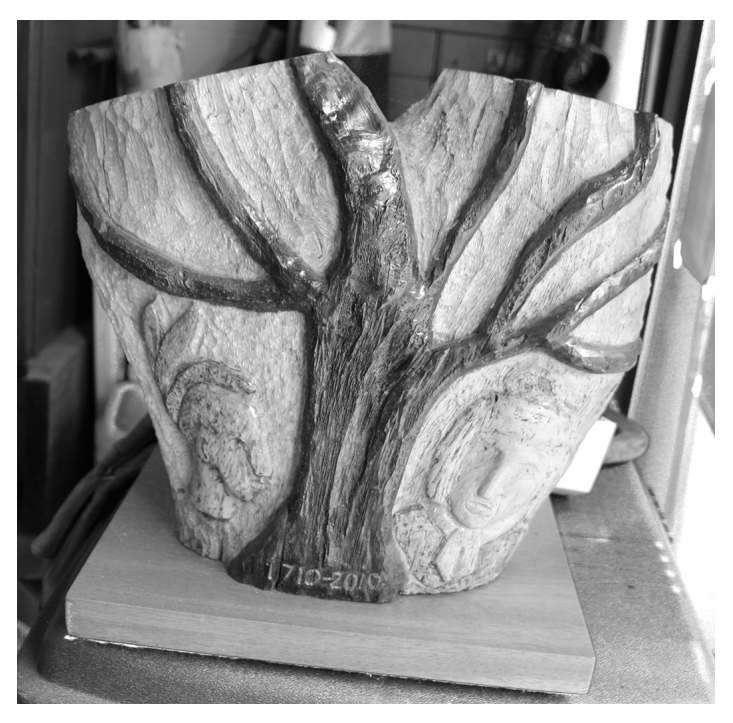
Carving commerating the 300th Anniversary of the Richland Friends Meeting

change. Also, the nature of wood makes the pieces limited to indoor exhibits. Alternately, with stone, the sheer weight limits the size of the piece because of transport and installation issues while at shows. Overall, our mason, turned teacher, turned sculptor enjoys the durability and permanence of stone and expects to do even more with it in his future.