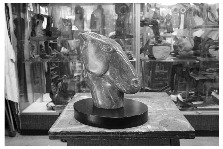
Equus carved from raspberry alabaster

change. Also, the nature of wood makes the pieces limited to indoor exhibits. Alternately, with stone, the sheer weight limits the size of the piece because of transport and installation issues while at shows. Overall, our mason, turned teacher, turned sculptor enjoys the durability and permanence of stone and expects to do even more with it in his future.