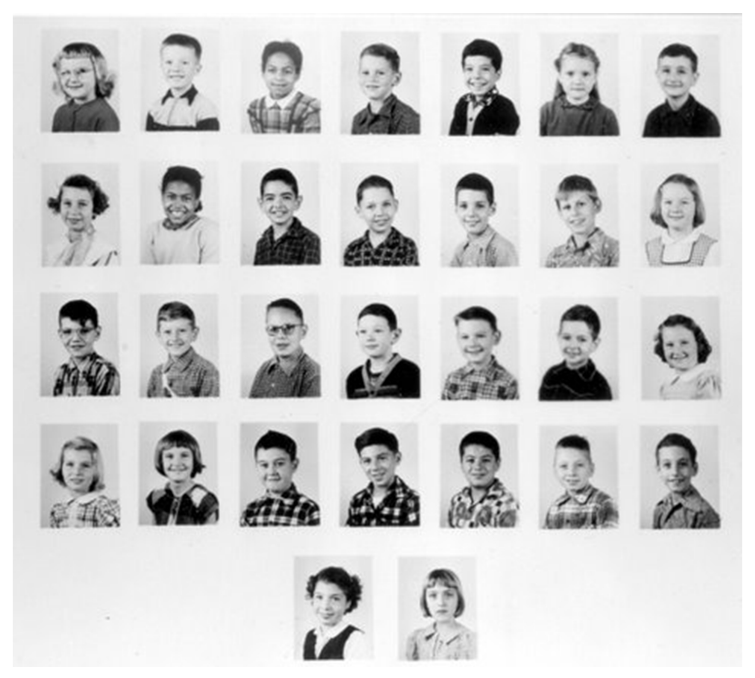
New Harrisburg One-Room School 1954-55