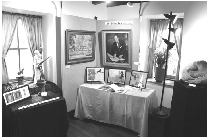
Several Artists of Our Past