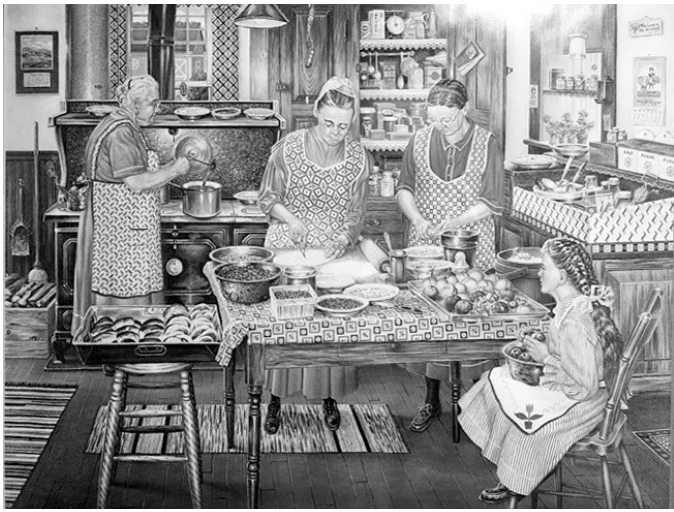
"Baking Day" by Tom Schenk