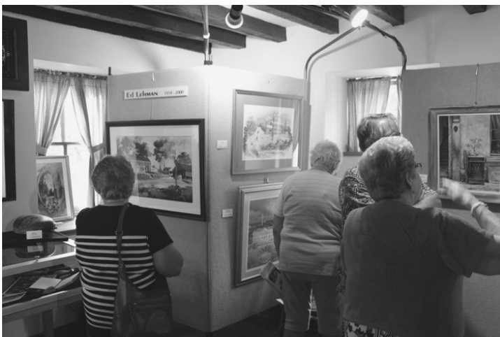
Visitors enjoying some of our artists