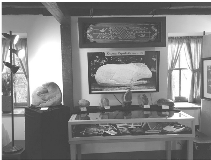
The George Papashvily Display