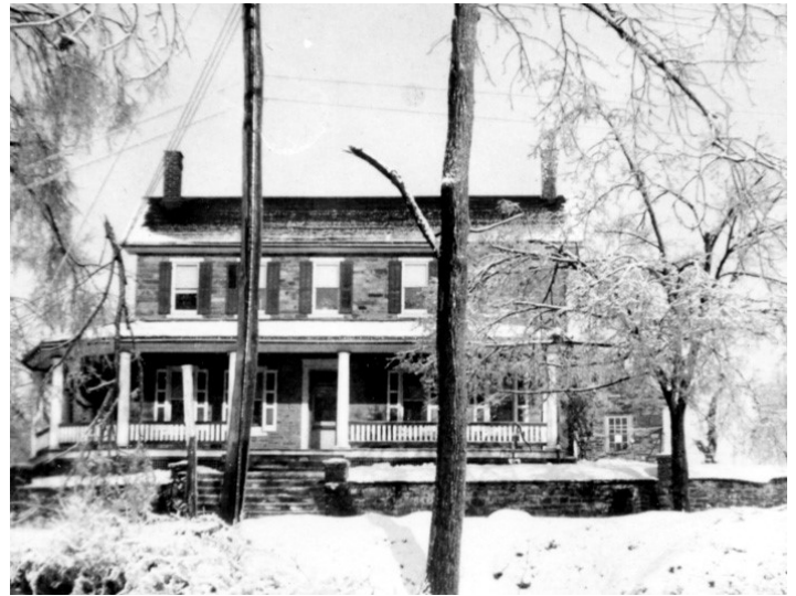
Edith Haines Home