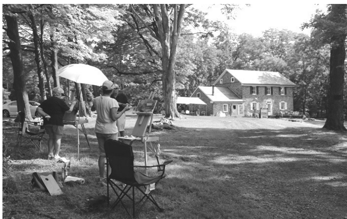
Present day artists were working outside all morning