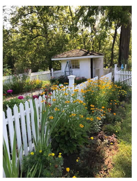
OUR GARDEN AT THE STOKES HOUSE

If you know a talented artist or craft person who should be in the show, please encourage them to visit our website at: www.kringlechristmasshoppe.org