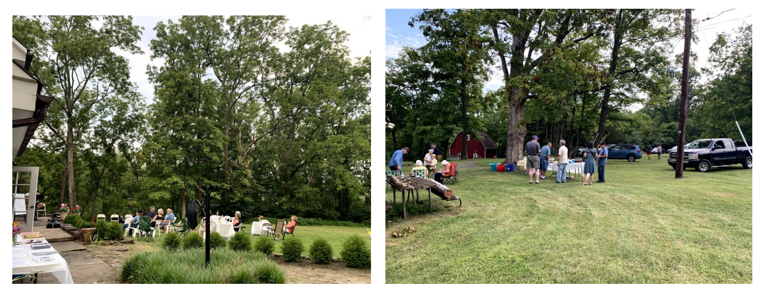
A nice group of members and neighbors attended the Stokes Open House on July 24th.

On July 24th we held our first event since the Covid lockdown. Many members and guests enjoyed refreshments, music and a tour of the Stokes House.