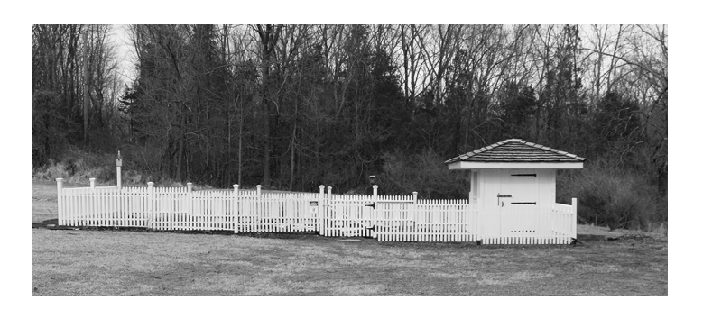
Our Garden Grows!

Our fenced in garden has been enlarged. Lester Goldthorp built the fence and Pat DeWald painted it. Our museum collection continues to grow steadily, more research materials are available, and homes for more birds and wildlife are expanding.