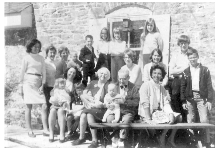
Three generations of the family in front of the Stokes House

Lake Towhee provided a special place in summer to overturn rocks in search of worms for fishing the lake. The