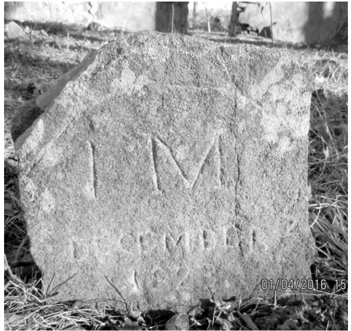
Grave stone at the Old Methodist Meeting House Cemetery