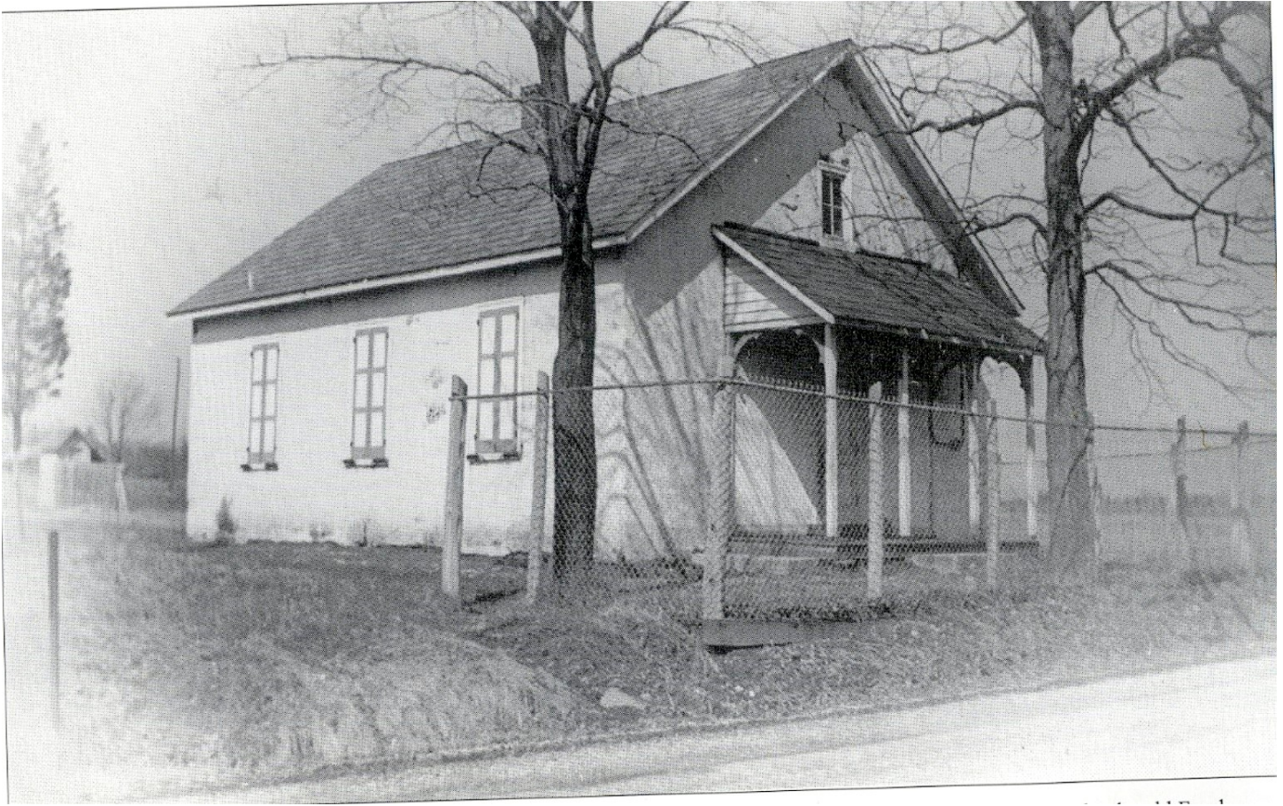
Hickory Grove School about 1941 or 42.