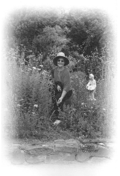
ry Therapists Specialize Your Homecare Needs

My childhood growing up in Applebachsville, being part of the farm, and attending the one room school houses of Haycock was a time of little monies and material things but a childhood of golden memories. It was the "good old days." I think of it like the TV show "Walton's Mountain."