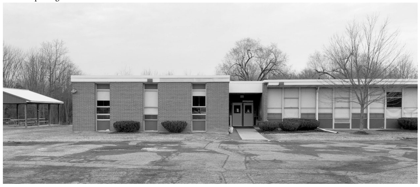
These doors near the left end of the building will be used for access to our meeting room.

Haycock Township has acquired the former elementary school and will be using it as a community center. The Haycock Historical Society will hold our regular meetings in one of the community rooms at the far left end of the building as seen from the parking area off of Old Bethlehem Road.