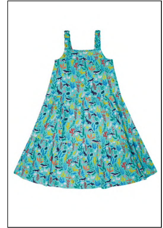
Baby, Toddler & Kidswear