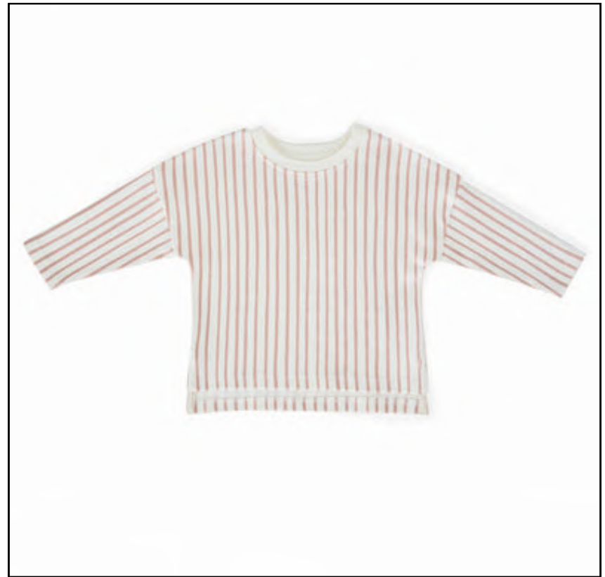
Baby, Toddler & Kidswear