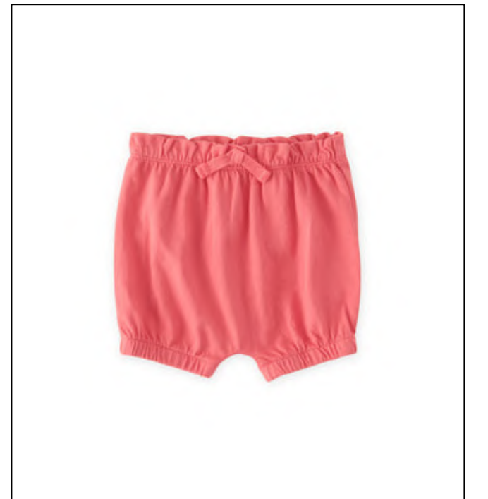
Baby, Toddler & Kidswear