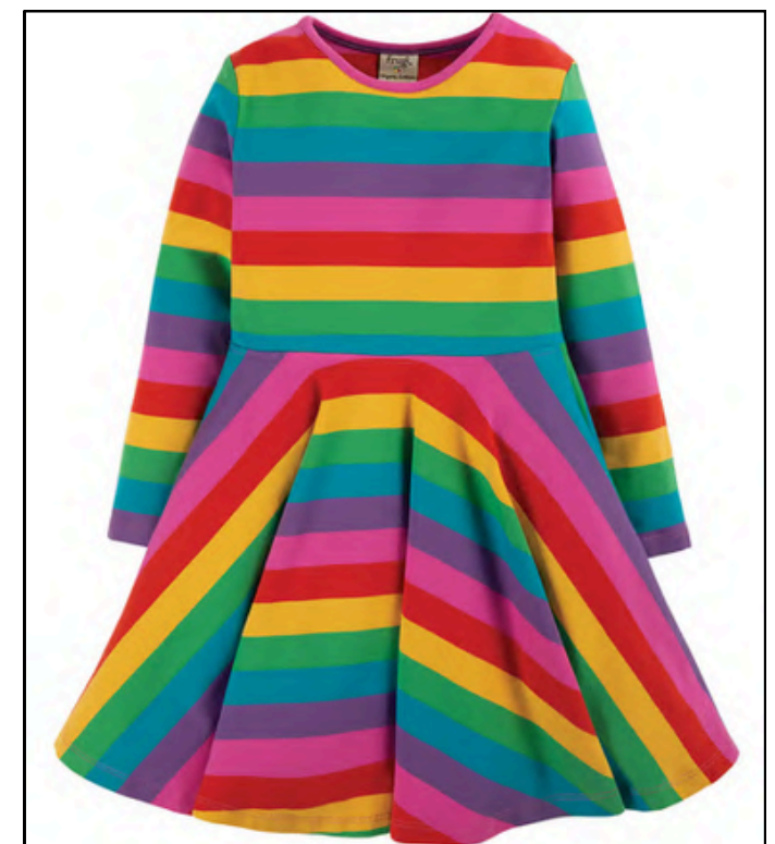
Baby, Toddler & Kidswear