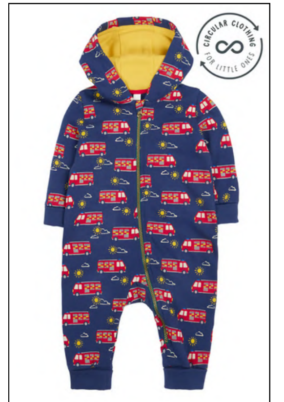
Baby, Toddler & Kidswear