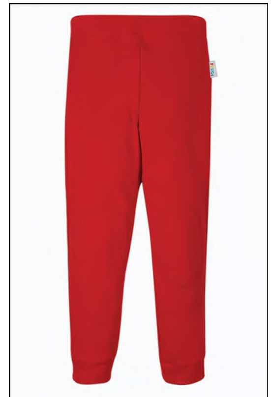
Baby, Toddler & Kidswear