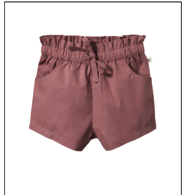
Baby, Toddler & Kidswear