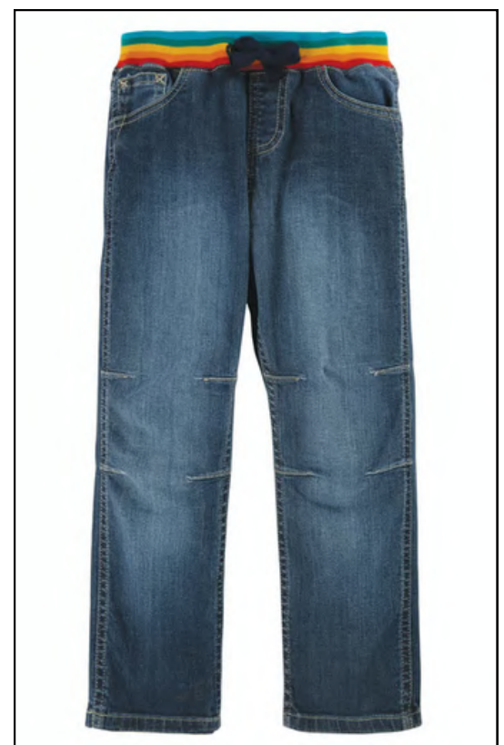
Baby, Toddler & Kidswear