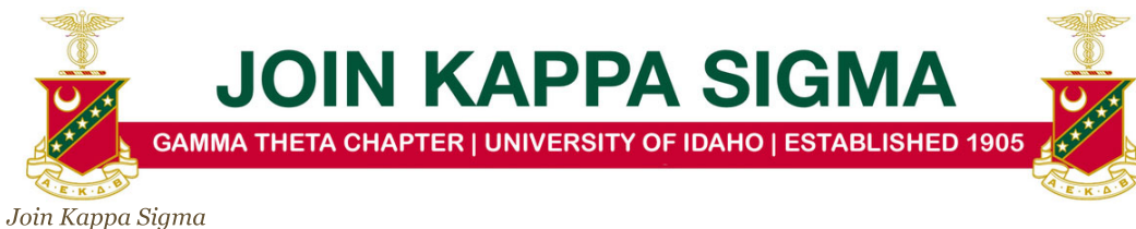
Join Kappa Sigma

Finally, do you have plans for a regional gathering of Kappa Sigmas in your area or would you like to be a part of a Rush event - send a message to alumniboard@918blake.org to let us know and we'll help connect those in your area.