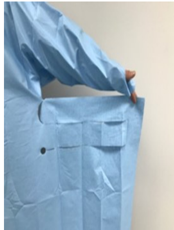
Side Tie System