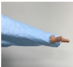
Thumb Holes Better Coverage