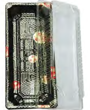
TZ001 Sushi Tray Color