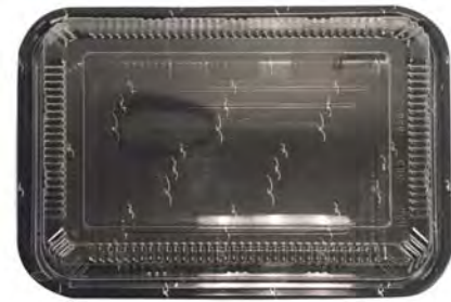
TZ830 Lunch Box Black