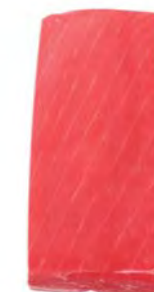
Tuna Saku Block AAA