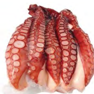
Madako Tako Leg