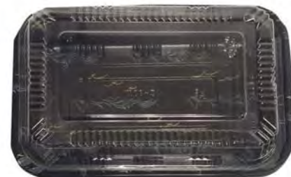
TZ810 Lunch Box Black