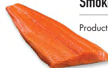
Smoked Salmon Fillet