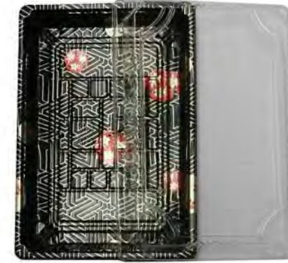
TZ010 Sushi Tray Color