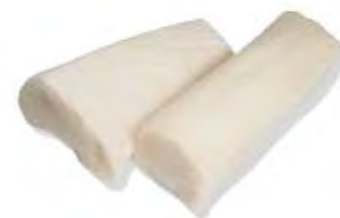
Escolar Saku AAA