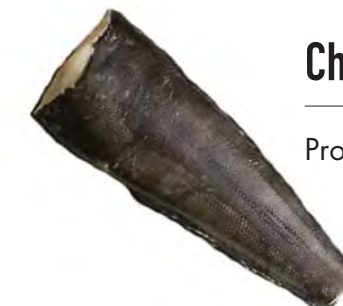
Chilean Sea Bass H&G

Product ID: 40211 11 oz 2 pc/11 lb Product ID: 40230 12 oz 2 pc/11 lb