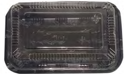
TZ825 Lunch Box Black