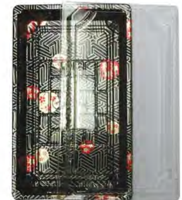
TZ020 Sushi Tray Color