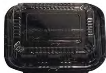
TZ807 Lunch Box Black