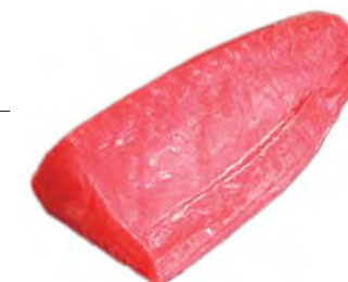
Tuna Loin Center Cut