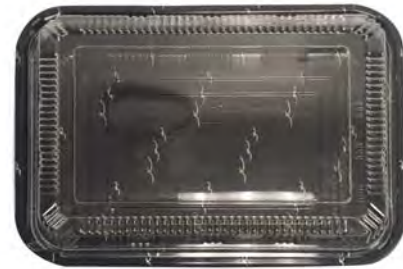
TZ820 Lunch Box Black