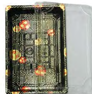
TZ015 Sushi Tray Color