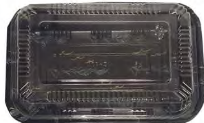
TZ815 Lunch Box Black