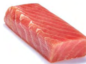
Tuna Saku AAA-Yellowfin