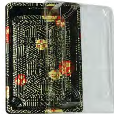
TZ008 Sushi Tray Color