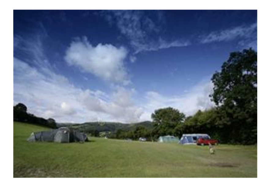
Wern Isaf Farm