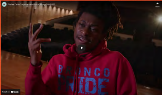
Spoken Word for Localish