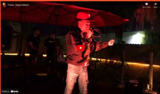
Performance at Hippie Hideout