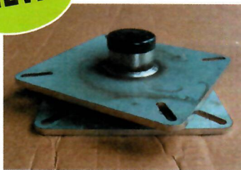
STAINLESS SWIVEL SEALED BEARINGS