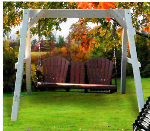
SWING SPRINGS (OPTIONAL)