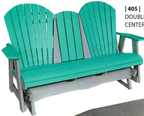
| 405 | DOUBLE GLIDER WITH CENTER CONSOLE