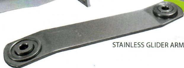
STAINLESS GLIDER ARM