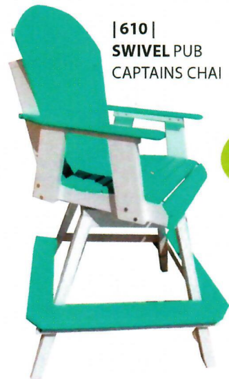
| 610 | SWIVEL PUB CAPTAINS CHAI