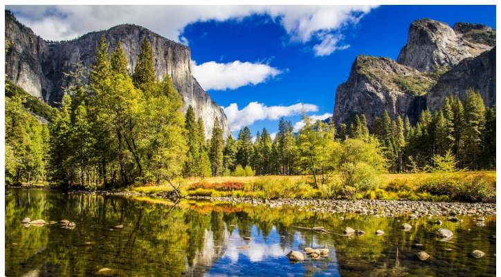
September 6 – Trust Yosemite National Park