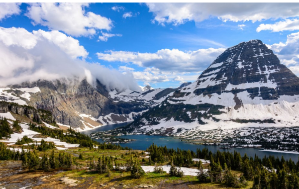
August 16 – Consequences Glacier National Park