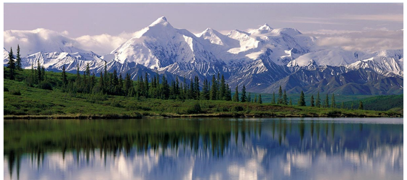
August 23 – Name Denali National Park