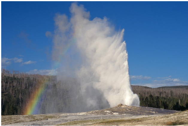
August 2 – Faithfulness Yellowstone National Park