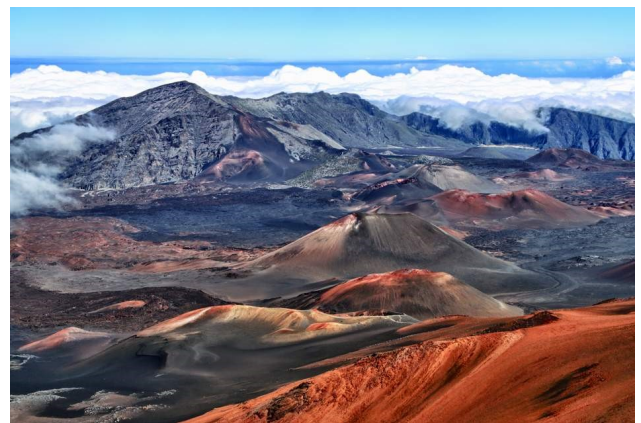
August 9 – Paradox Hawaii Volcanoes National Park