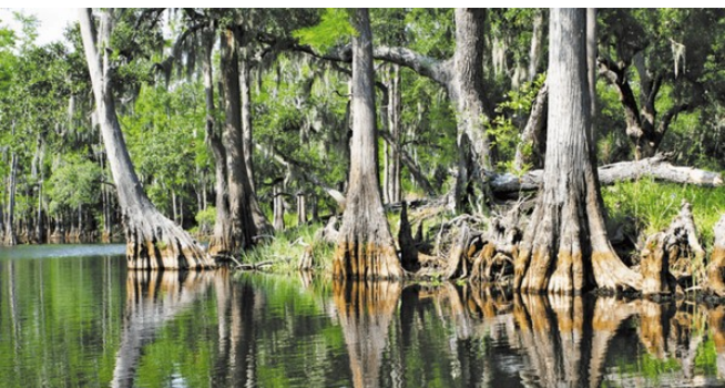
August 30 – Preservation Everglades National Park