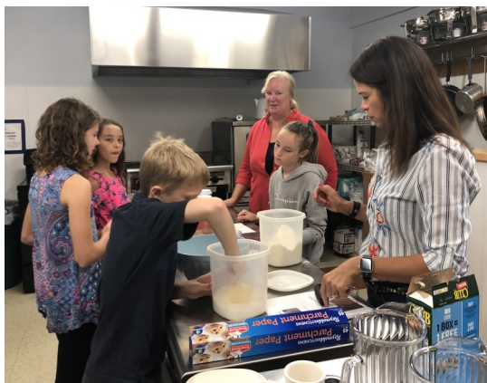
Communion bread making & chalice personalizing