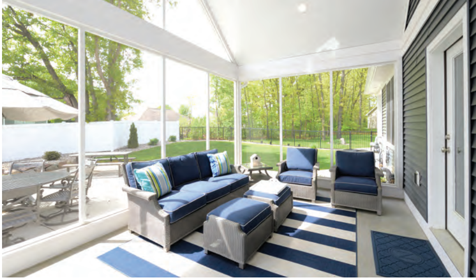
From the top of the gable almost to the floor, screening on the poolside porch lets breezes flow through yet keeps out evening's biting insects.