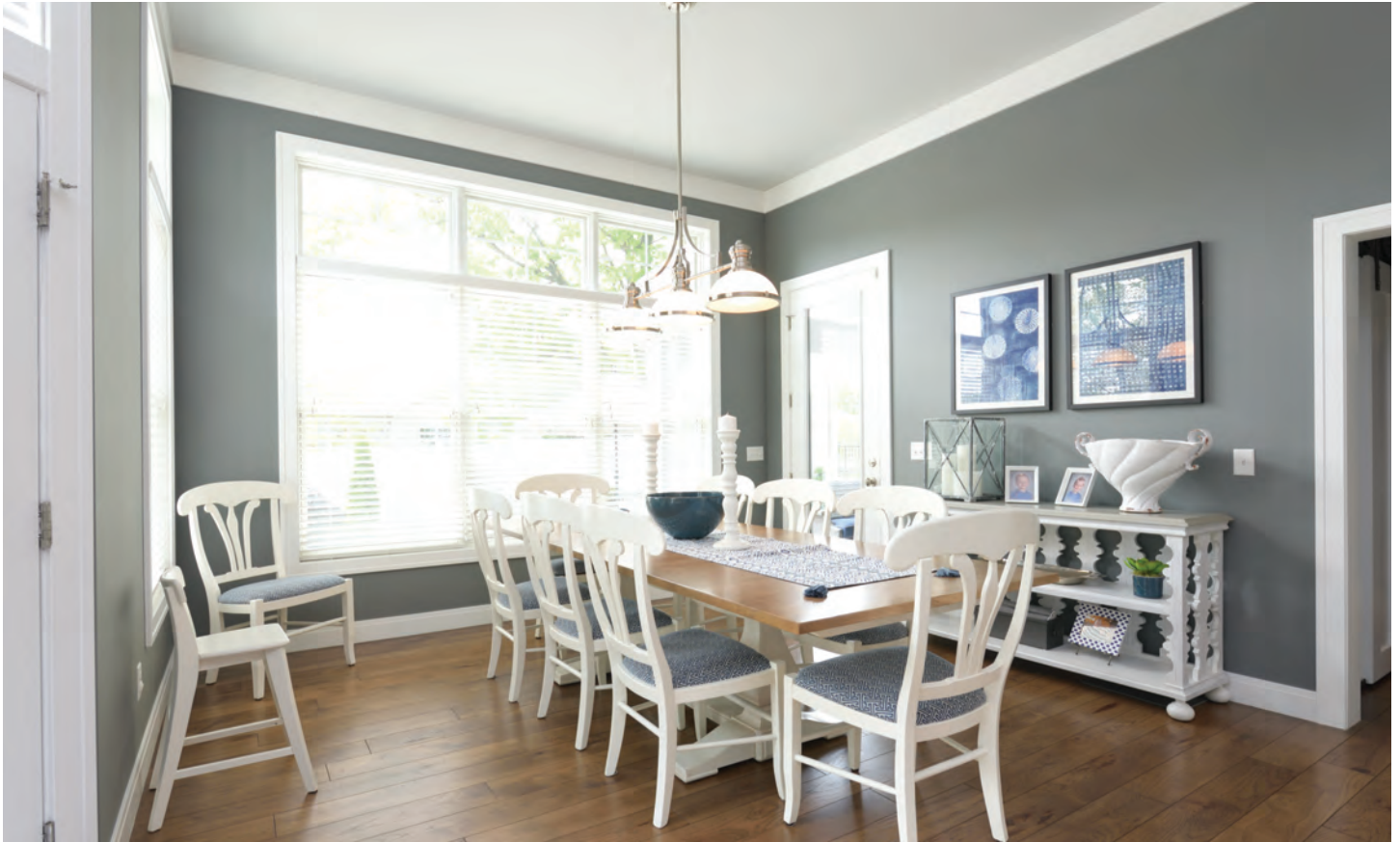
Situated right off the kitchen, the brightly-lit dining area with its hickory floor can hold a lot of hungry guests or family members.