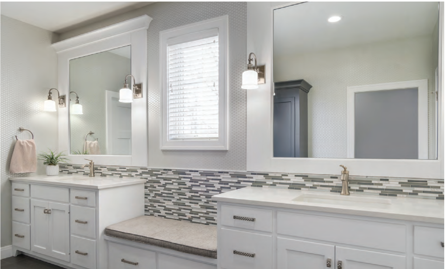
A bench seating area in the master bathroom between two vanities is a convenient place to lay out clothing while getting dressed, or to sit while putting on shoes.