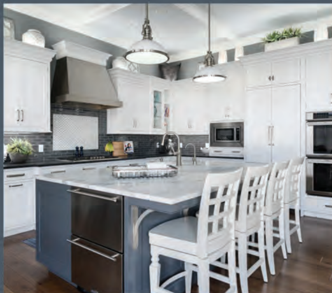
TRADITIONAL | CONTEMPORARY | TRANSITIONAL | MODERN