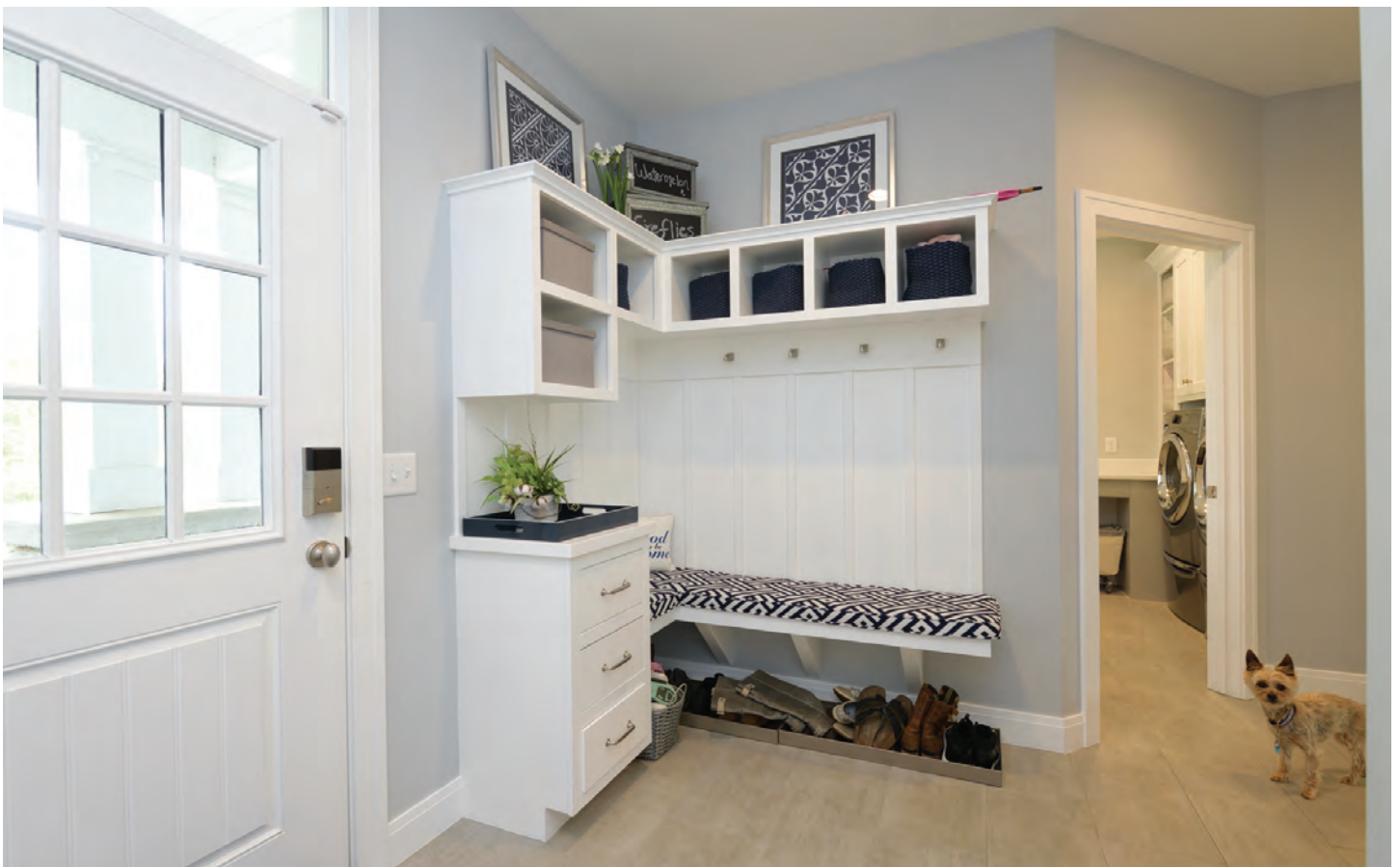
A fierce guardian stands watch on the practical porcelain tile floor in the mudroom.