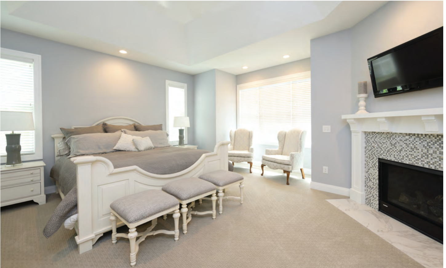
In the master bedroom, a tray ceiling gives volume to the space while the gas-log fireplace provides both ambiance and extra heat in the winter.