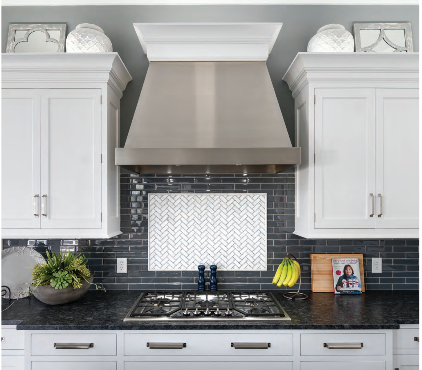
A stainless steel range hood with wood accents, integrated into a patterned tile backsplash behind the cooktop, adds visual interest to the kitchen.