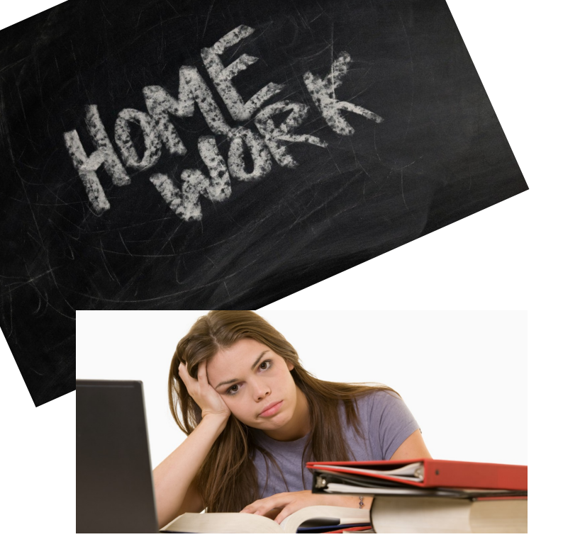
Blessed are those who find wisdom, those who gain understanding—Proverbs 3:13

As a new school year quickly approaches, we are planning to continue our Homework Helper program. In order to help our communities students we must have the infrastructure to do so. For this program, that means access to the building and internet capabilities, loving and patient adults to help our students, technology to supply those who may have forgotten their own, snacks for those who may not have food at home, etc. You get the picture. We need your help in these efforts. Please pray about this program. If you are will, able, and feel led to help, please reach out to Nicki. You must be able to pass a background check to serve in this capacity.