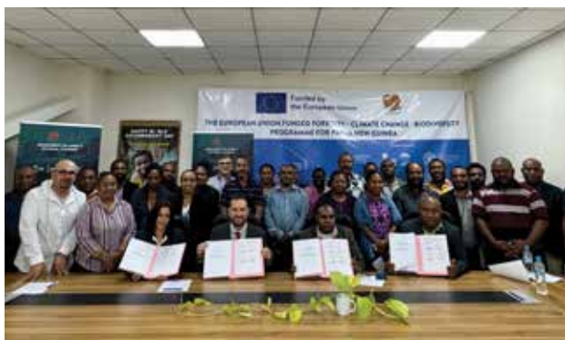
Agreement signed with DLPP.

an MoU to strengthen biodiversity conservation, enforce the Protected Areas (PA) Act, and improve institutional capacity.