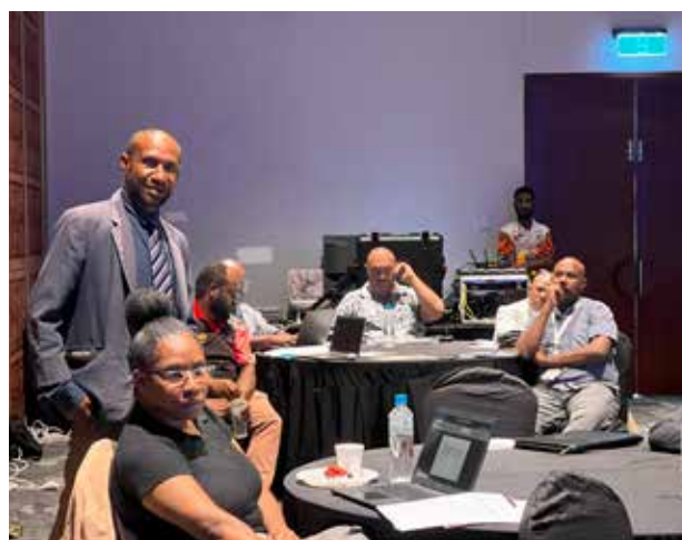
A participant making a point during discussion.