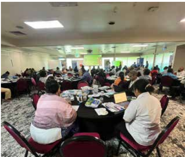
Participant at the PA Forum Series

The European Union-funded Forestry-Climate Change-Biodiversity Programme under the national component led by Expertise France, with the Conservation and Environment Protection Authority (CEPA), launched its 2024 Protected Areas (PAs) Forum Series in September in Port Moresby. This initiative, stemming from a July 2024 MOU, is to enhance environmental protection and sustainable livelihoods in PNG.