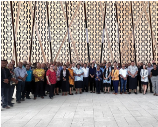
Participants take a group photo.

As part of the national component of the EU-FCCB Programme, Expertise France, the agency responsible for the national and institutional components, has developed a Provincial Intervention Strategy for six target provinces.