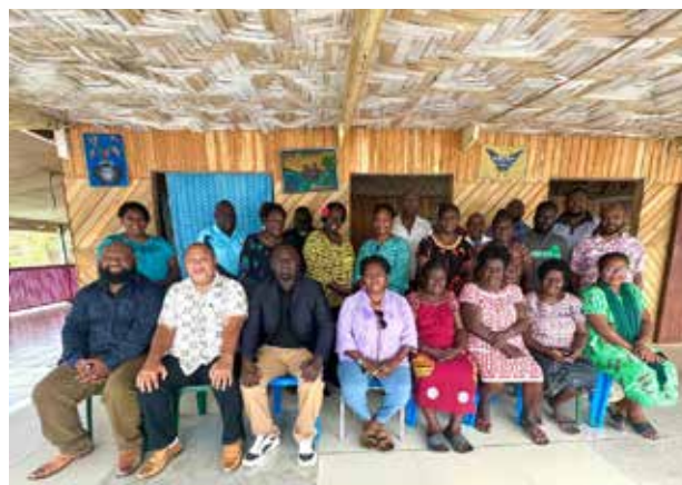
The Blue Green Economy Policy review took a period of three-week, from consultation to validation workshop. It engaged local stakeholders, allowing them to contribute insights and feedback on the policy framework.

Supported by the European Union-funded Forestry-Climate Change-Biodiversity (EU-FCCB) Programme | National Component, the GBE Policy aims to promote sustainable practices that protect Bougainville's natural resources while providing economic opportunities. This strategic initiative seeks to position