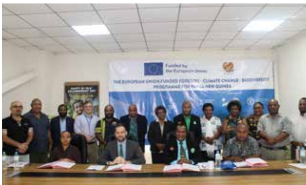
Agreement signed with DAL.