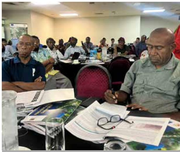
Participant at the PA Forum Series

The PA forum started in 2021 with the support of UNDP GEF-6 and will continue in the future with backing from partners and government agencies to sustain CEPA's efforts to address significant challenges faced by PNG's PA Network. This will also address gaps in business & financial planning, and limited stakeholder experience.