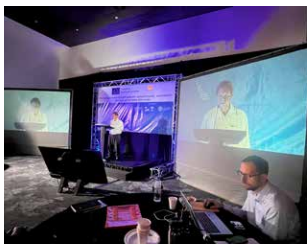
A participant at the session.