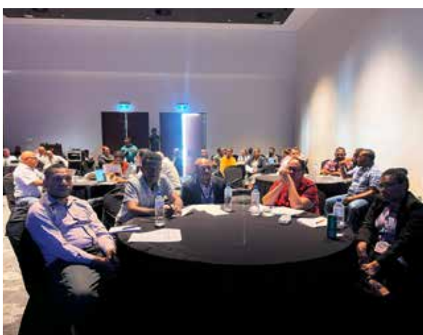
Participants at the session.