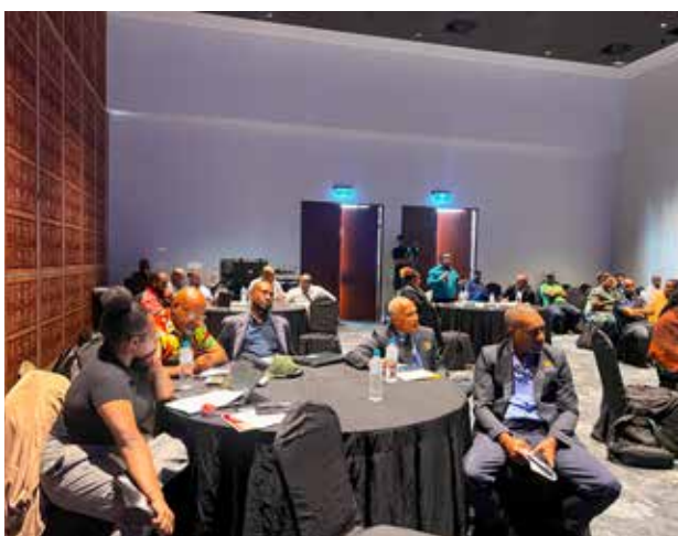
Participants at the session.