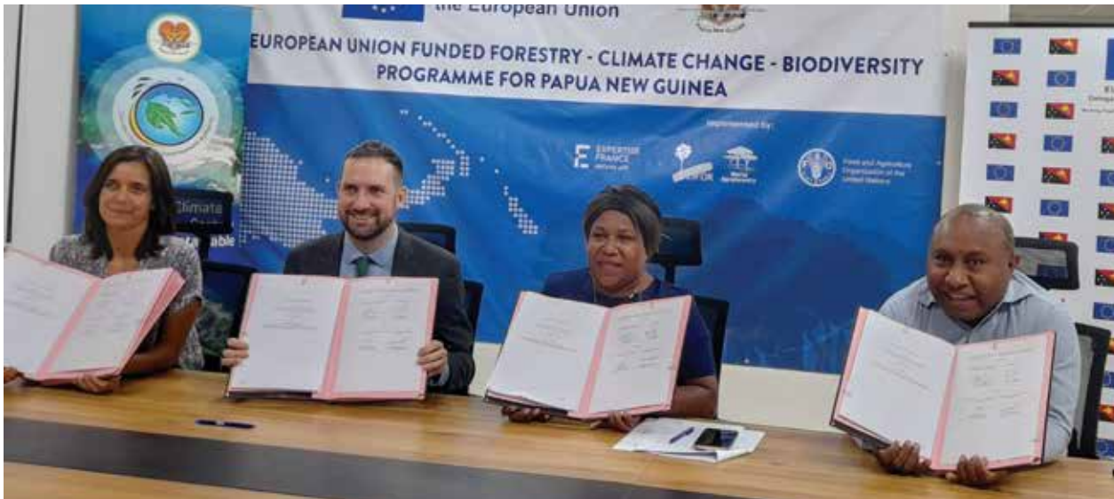
Agreement signed with CCDA.