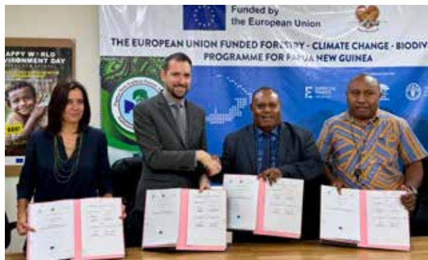
Agreement signed with PNGFA.

Papua New Guinea (PNG) has taken a major step toward sustainable resource management and climate action with the signing of six Memorandums of Understanding (MoUs) between six government agencies and Expertise France under the EU-funded Forestry-Climate Change-Biodiversity (EU-FCCB) Programme.