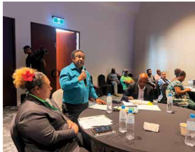
During discussion session.

This strategy aims to enhance the implementation of forestry, climate change, and biodiversity (FCCB) policies and regulations at the provincial level through targeted stakeholder consultations and workshops.