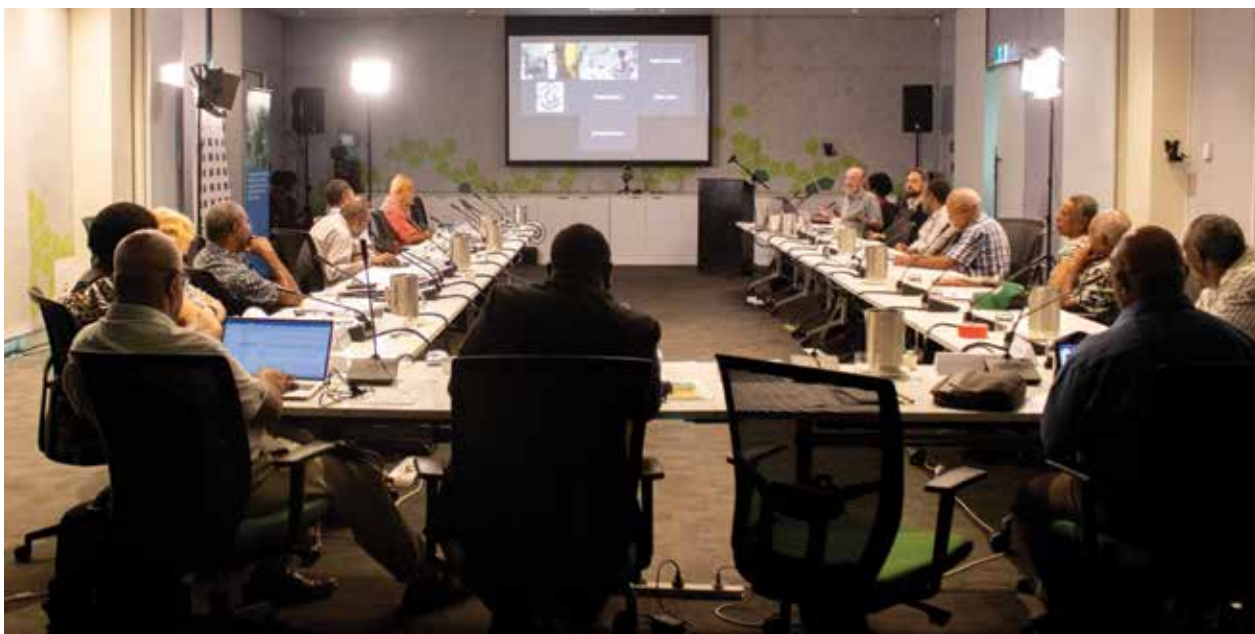
Master's Scholarship panel interview conducted at the Hilton Hotel conference room.