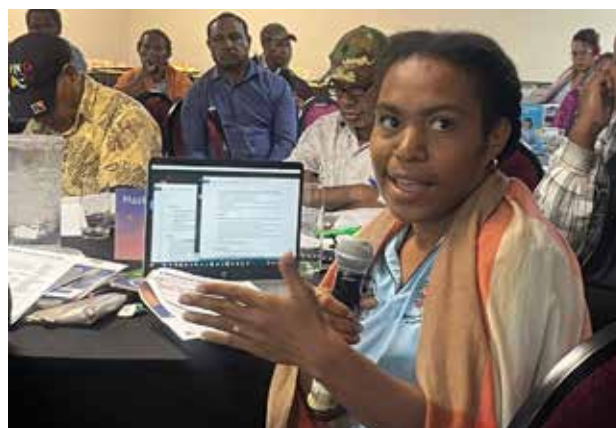
Participant at the PA Forum Series

The series is also to raise awareness of PAs, promote regional collaboration & bridge the gaps between policy and practice. It will utilise PNG traditions & cultures to promote "Story Books from our Childhood" to tell stories about our environment. The traditional knowledge from PAs needs to be shared and children's storybooks are used to convey it to the world.