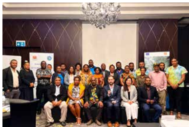
Participants take a group photo.

Through the EU-FCCB Programme, PNG is enhancing its climate reporting