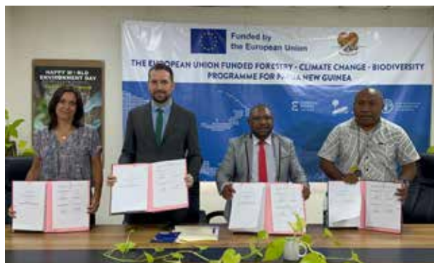
Agreement signed with CEPA.

The Climate Change and Development Authority (CCDA) committed to advancing climate action under PNG's Enhanced Nationally Determined Contributions (NDCs), focusing on emissions reduction and climate resilience.