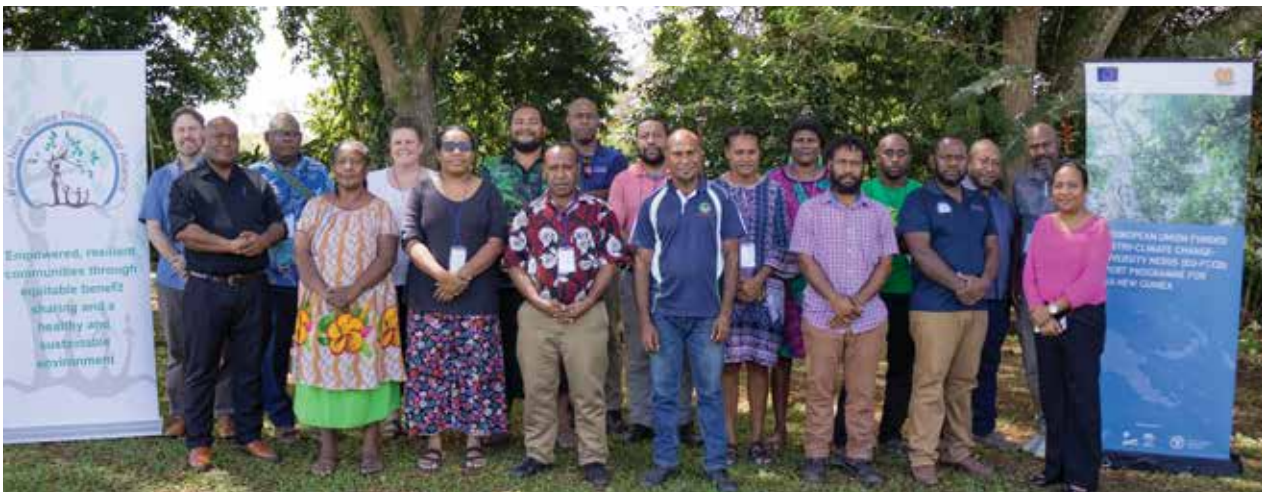
Representatives of different Civil Society Organisations that attended the strategic planning session. Photo: Clive Hawigen EU-FCCB | National Component