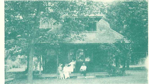
Cottage Life at Van Buren

Much of the popularity of Van Buren Point must be attributed to its location. Located on Lake Erie about halfway between Buffalo and Erie, it is reached by rail over the Pennsylvania and New York Central Lines at Dunkirk. Paved roads make it easily accessible by motor from the East, South and West. Nearby points of interest, all reached by the finest hard-surfaced roads, include the Chautauqua Lake district, Lily Dale, Panama Rocks, East Aurora, and Niagara Falls.