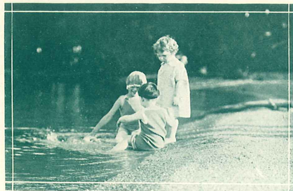
Safe Bathing for Children

Soon you will be living in this fragrant atmosphere, for June is the month of welcome.