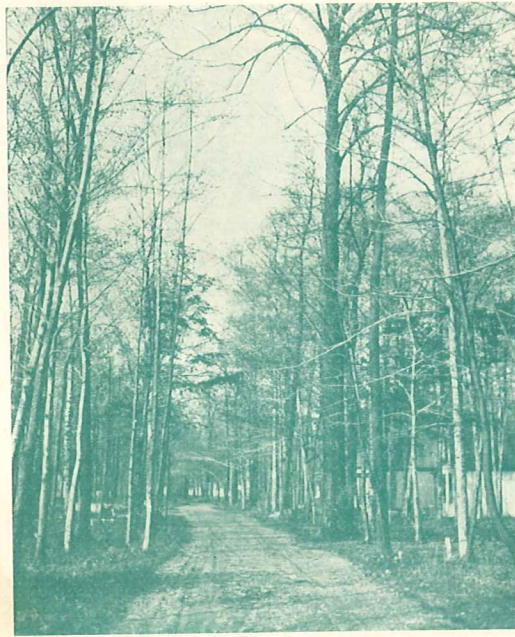
Lake Shore Drive

Much of the popularity of Van Buren Point must be attributed to its location. Located on Lake Erie about halfway between Buffalo and Erie, it is reached by rail over the Pennsylvania and New York Central Lines at Dunkirk. Paved roads make it easily accessible by motor from the East, South and West. Nearby points of interest, all reached by the finest hard-surfaced roads, include the Chautauqua Lake district, Lily Dale, Panama Rocks, East Aurora, and Niagara Falls.