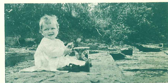
Children's Play Ground

In the past seasons many have taken advantage of the opportunity to spend a week or two at the Inn and special rates are made for those who desire that kind of accommodations. Reservations should be made at an early date and information may be obtained by addressing, The Inn, Van Buren Point, N. Y.