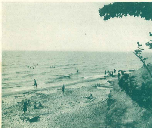
Ideal Bathing Beach

Van Buren Point offers a wide variety of amusements—here the lover of the great out-of-doors may indulge in that sport or pastime which gives him his greatest pleasure.