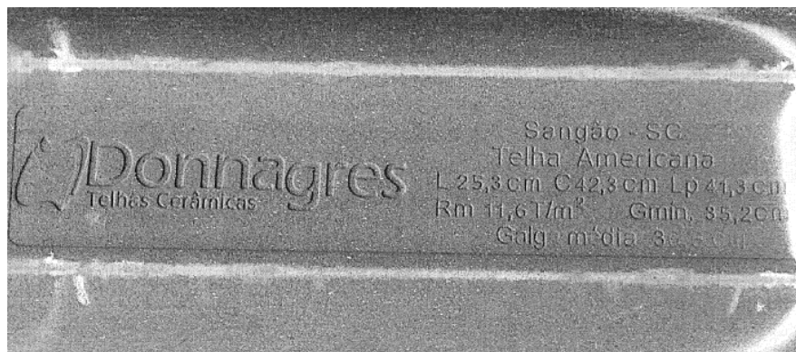
IDENTIFICATION MARK FOR DONNAGRES SPANISH "S" CLAY ROOF TILE (LOCATED ON UNDERSIDE OF TILE)